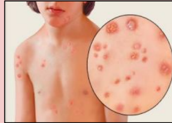
Chicken Pox (Shingles)