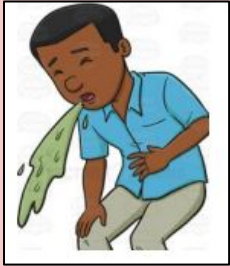
Sickness and Diarrhoea, Gastroenteritis, Food poisoning.