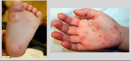
Hand, Foot and Mouth