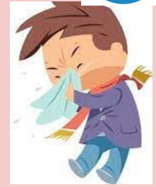
Common cold with a raised temperature, drowsiness or shivers