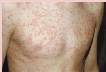
Rubella (German Measles)