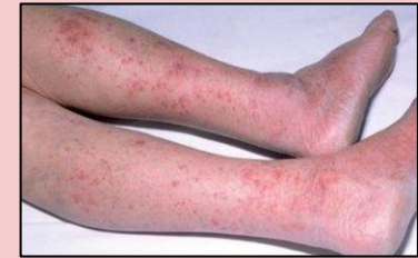
Meningitis, Meningococcal meningitis and meningitis Septicaemia, viral