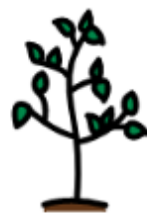
Saplings Curriculum Newsletter

We will be building on our ICT skills through cause and effect activities.